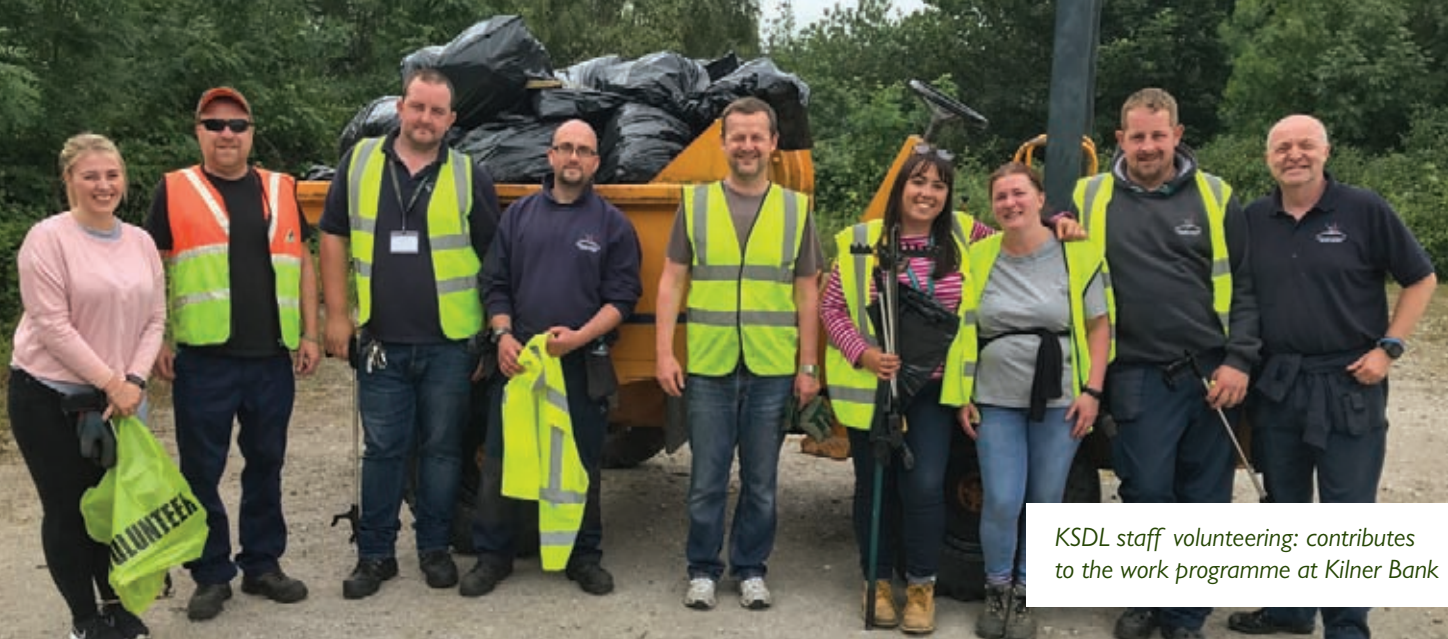
KSDL staff volunteering: contributes to the work programme at Kilner Bank