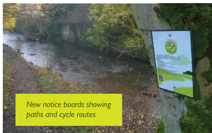
New notice boards showing paths and cycle routes