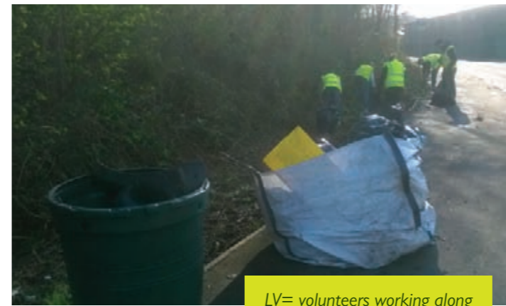
LV= volunteers working along the Lockwood Greenway