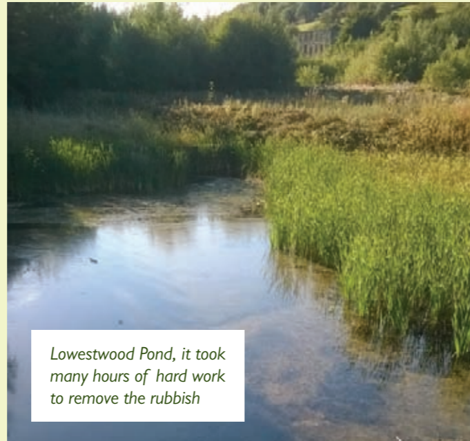
Lowestwood Pond, it took many hours of hard work to remove the rubbish

Sponsored by Thornton & Ross Ltd, Titanic Spa (both Salmon Supporters)