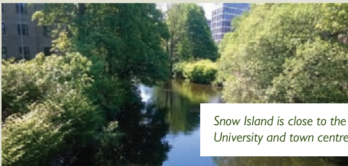
Snow Island is close to the University and town centre

With new funding, Greenstreams is developing the Snow Island area (off King's Mill Lane) as a public amenity, creating feature gateways and restoring the riverside footpaths in the area. This is a key area of riverside (and a designated Open Space) that has received little attention despite its potential as a destination for use by local communities and students.