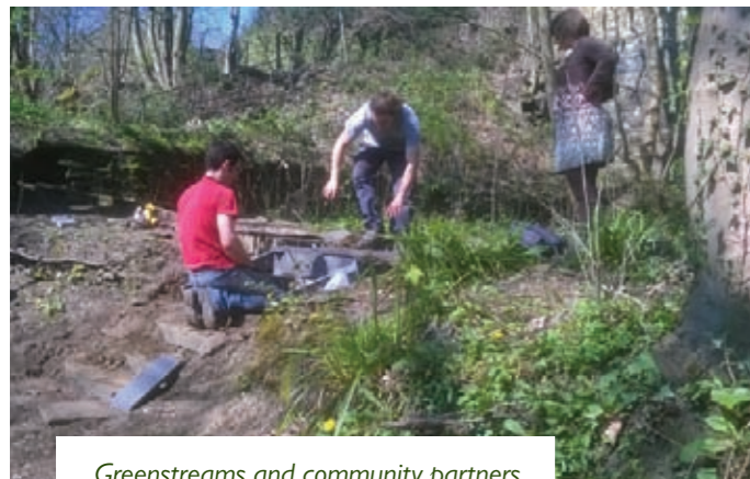
Greenstreams and community partners have installed new Milnsbridge steps