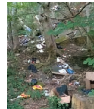
Some of the fly-tipping along the footpath at Lockwood Spa