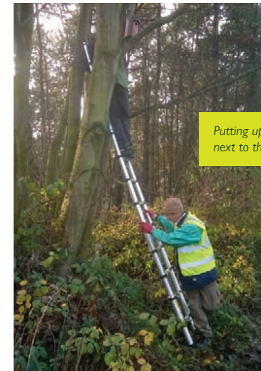
Putting up starting boxes next to the Greenway