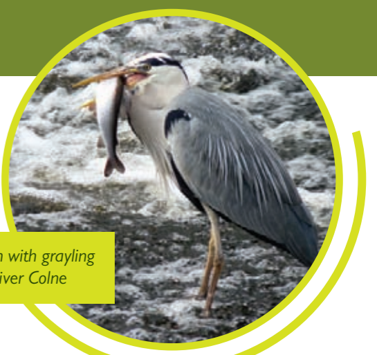
A heron with grayling in the river Colne

Please report any sightings on our website.