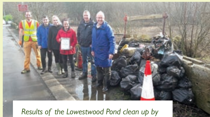
Results of the Lowestwood Pond clean up by volunteers from local business, Thornton & Ross

An information board about the pond and its importance is being erected at the site. With the help of staff volunteers from Thornton & Ross, the pond has also been cleared of massive amounts of rubbish (including over 500 plastic bottles), which has accumulated over many years.